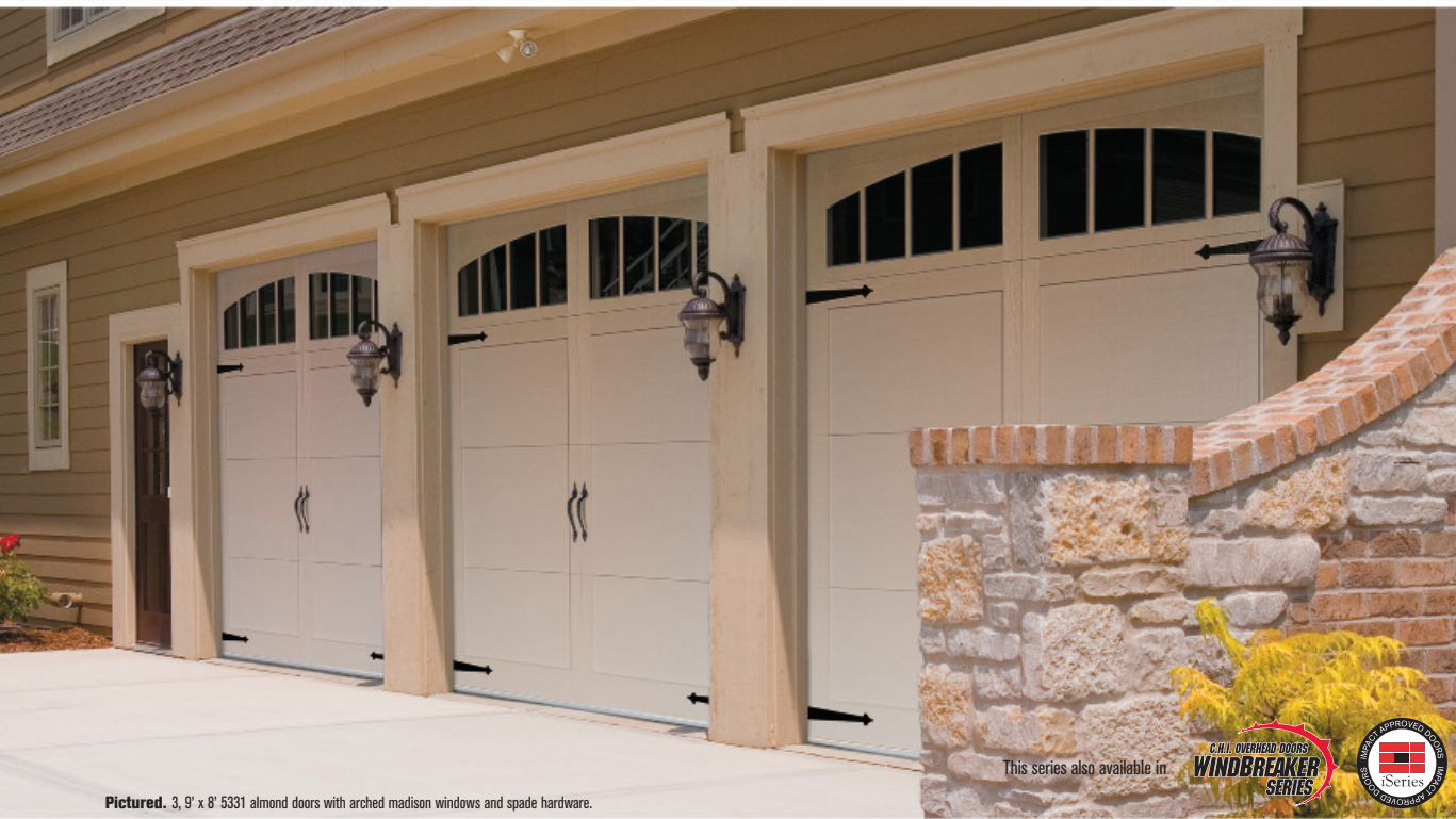
Pictured. 3, 9' x 8' 5331 almond doors with arched madison windows and spade hardware.